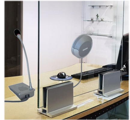
Ideal counters & ticket offices All in one autonomous kit

Smart audio features Optimal audio quality