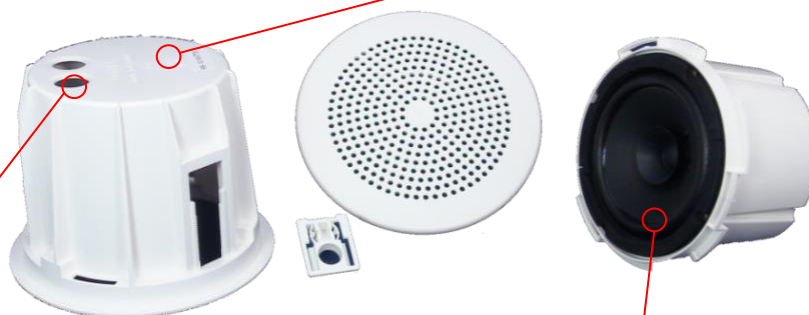
Fast installation Connection without tools