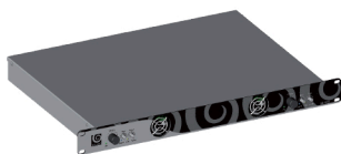
Amplifier 2 x 250 W AD1-2250