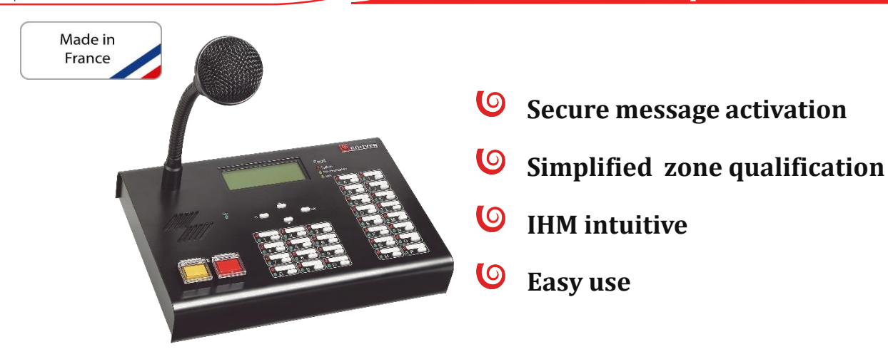
Sound system Diagnostic Microphone console

The GX-2500 microphone console is a control console for Voice Alarm central monitoring unit.